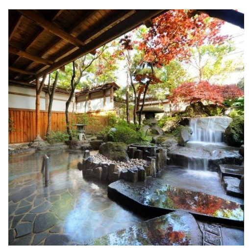
Asamushi Hot Spring