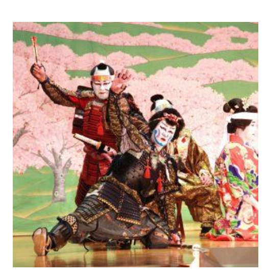
Fishermen's Kabuki Performance