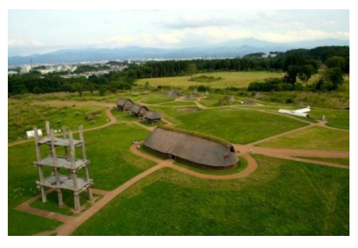
Sannai Maruyama Historical Site